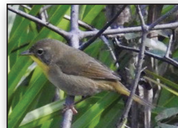
female Common Yellowthroat

Your yard could attract Common Yellowthroats if it is fairly large (yellowthroat territories are sometimes as small as 0.5 acre) and features dense or tangled, low-growing grasses and other vegetation.