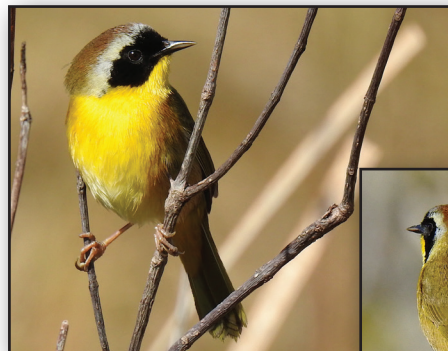
male Common Yellowthroat