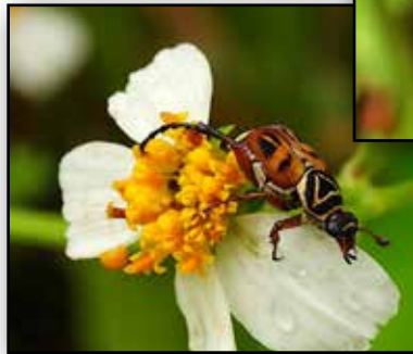
Delta Flower Scarab Beetle

The safety of our membership is of upmost importance, we encourage everyone to, please, wear a mask.