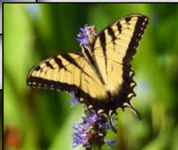
Tiger Swallowtail Butterfly