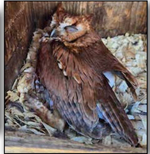
Eastern Screech-Owl red morph