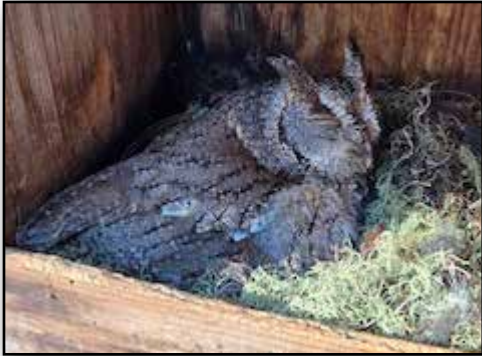
Eastern Screech-Owl gray morph

Our April 18 monitoring visit produced several surprises. The Great Crested Flycatchers were found in only three boxes instead of the suspected 6 from last month (good news). Bigger surprise was finding five Kestrel eggs in box 1 with both parents nearby. This box had an Eastern Screech-Owl last month. No one thinks SE American Kestrels could evict an Eastern Screech-Owl, so we just do not know what happened (but we are glad it did). Box 23 was empty last month and had five SE American Kestrel eggs this month. Rounding out our discoveries were the usual suspects of Eastern Bluebirds, and a Gray Squirrel mother nursing fur/hairless babies. We still have seven boxes with little or no use.