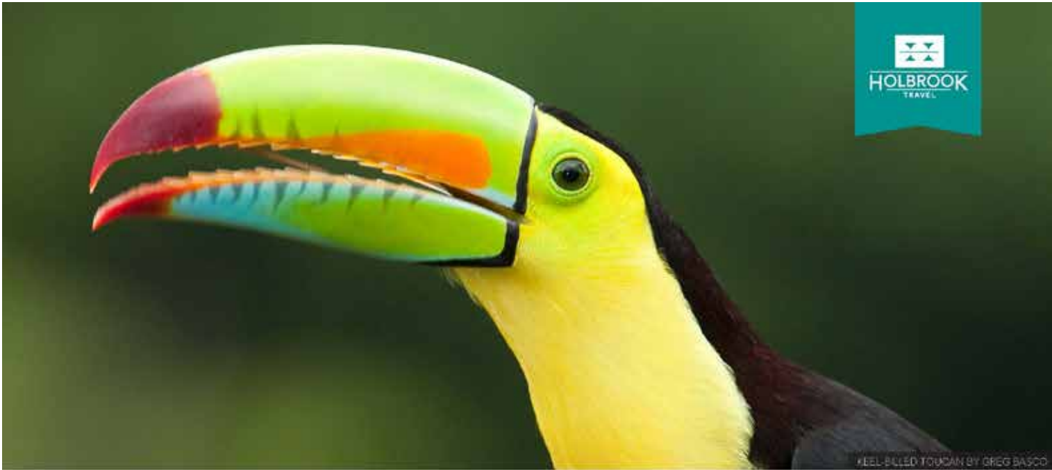
KEEL-BILLED TOUCAN BY GREG BASCO