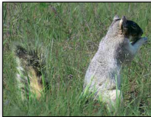
Southern Fox Squirrel