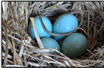
Eastern Bluebird eggs

During the day, the monitoring crew was treated to several interesting bits of nature. We spotted a gray and black Southern Fox Squirrel nearby box 6. We heard, then spotted a Summer Tanager at box 2 and saw a Bachman's Sparrow between box 22 and 4.