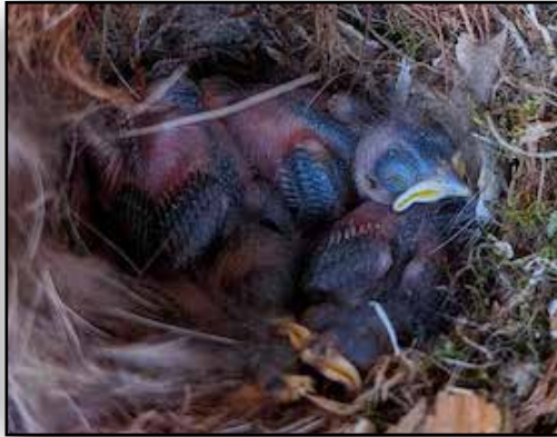
Great Crested Flycatcher chicks