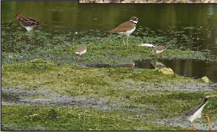
L to R: Wilson's Snipe, Least Sandpiper, Killdeer, Least Sandpiper and Lesser Yellowlegs

A shorebird you can see without going to the beach, Killdeer are graceful plovers common to lawns, golf courses, athletic fields, and parking lots. These tawny birds run across the ground in spurts, stopping with a jolt every so often to check their progress, or to see if they've startled up any insect prey. Their voice, a far-carrying, excited killdeer, is a common sound even after dark, often given in flight as the bird circles overhead on slender wings.