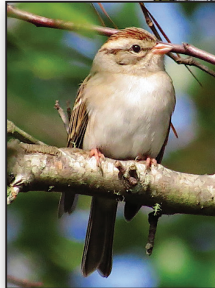
Chipping Sparrow Spizella passerina Band Code CHSP