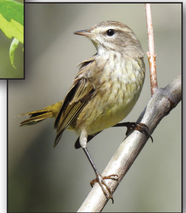
Palm Warbler Setophaga palmarum Band Code PAWA

For more information about these and other species