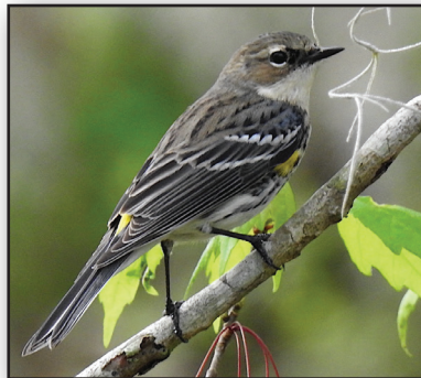
Yellow-rumped (Myrtle) Warbler (aka Butter Butt) Setophaga coronata Band Code YRWA