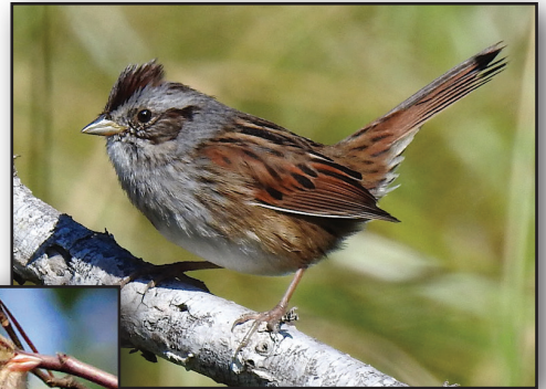
Swamp Sparrow Melospiza georgiana Band Code SWSP