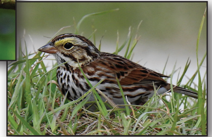
Savannah Sparrow Passerculus sandwichensi Band Code SAVS